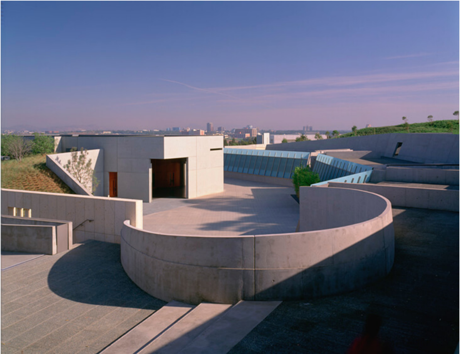
The Neurosciences Institute by Tod Williams Billie Tsien Architects

little Walt Disney, but we want our work to make the world a better place.”