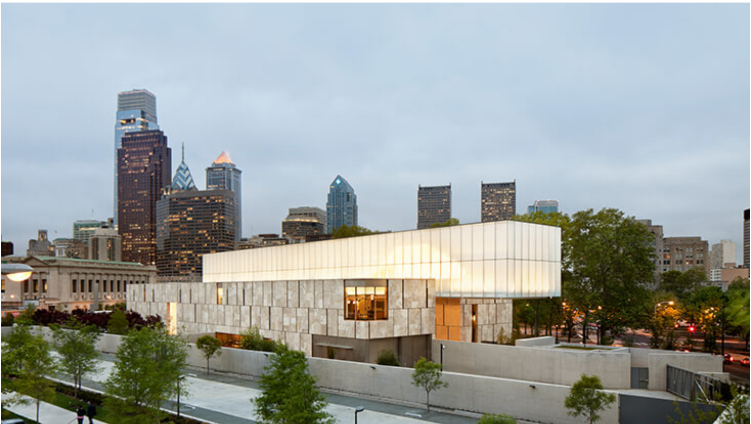
The Barnes Foundation designed by Tod Williams Billie Tsien Architects

Tsien describes how each brings something different to the table, pointing out, “We’re very different, and in that way we can work on the same project together, in the same office yet not be in the same place.” This fusion between artistic experimentation and pragmatic design is evident in their work together, which blends practical design with richly layered materials. Understandably, they are not without their conflicts, but these are usually balanced by respect and admiration for the other’s work. “We do get into arguments,” says Williams, “however, we like working with each other. If we worked individually, the quality of our output would drop by half.”