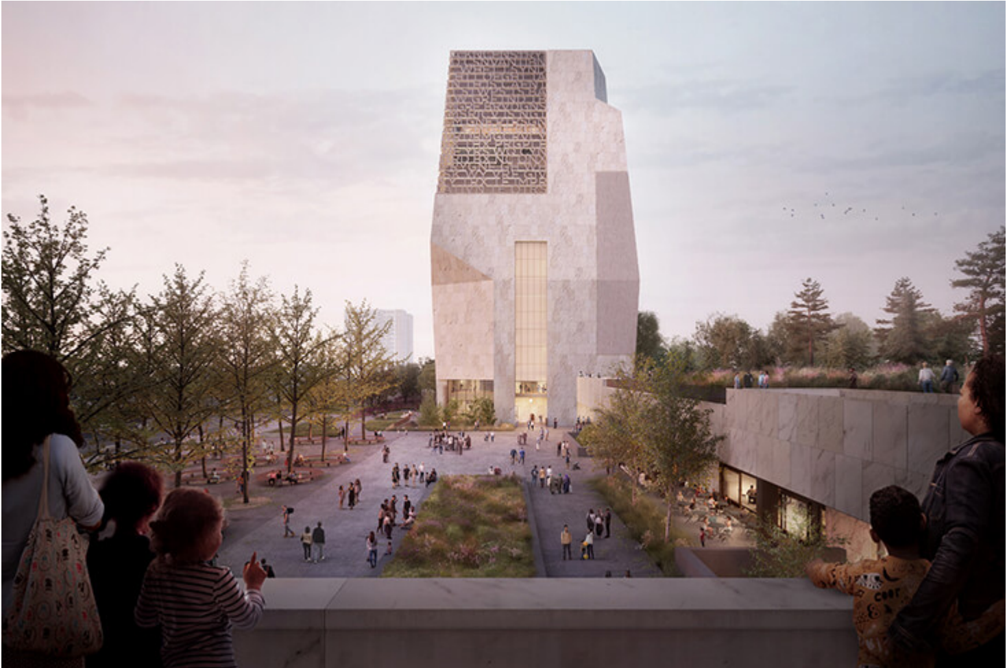
Billie Tsien and Tod Williams' design for the Obama Presidential Centre, 2016

sensuous tactility, including sand-blasted concrete, redwood, fossil stone and stainless steel.